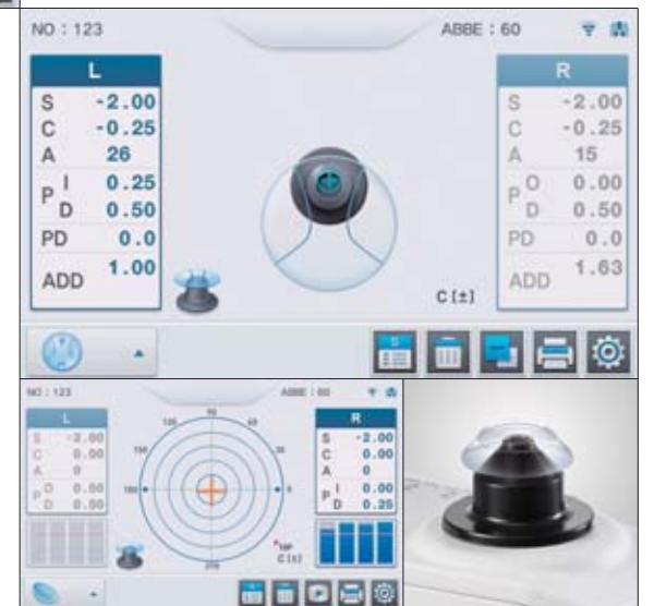
Contact Lens Measurement Contact Lens Measuring Jig