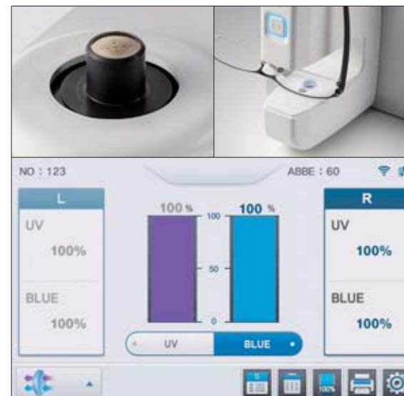
Blue Light Hazard and UV Measurement