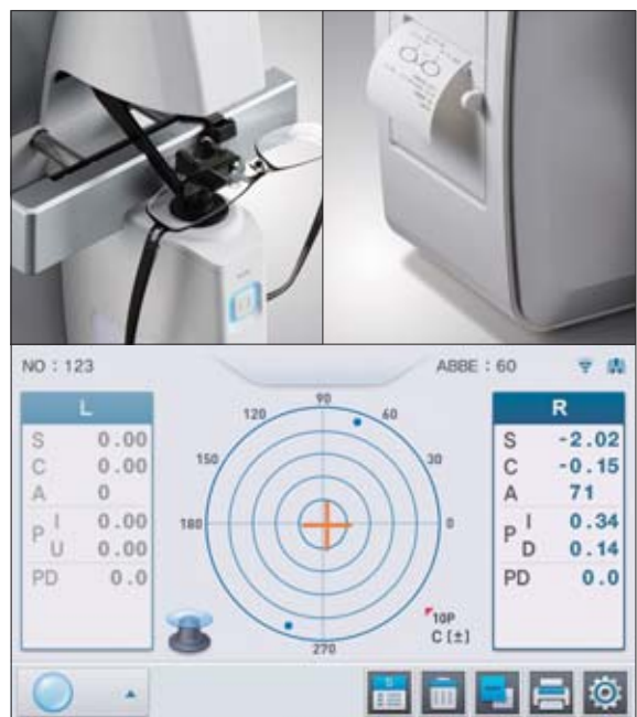
User-friendly Graphic Interface